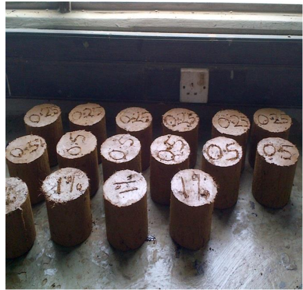
Figure 1b: cylindrical samples showing inscribed percentage fibre contents.