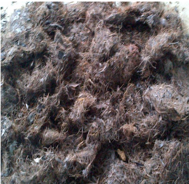
Figure 1a: Applied palm fibres

This paper therefore presents the effects of palm fruit fibres in randomly distributed reinforcement of clayey soils. Swelling values of uniaxial reinforced and unreinforced cylindrical samples (fig 1.) were measured and cracking characteristics studied, together with unconfined compressive tests.